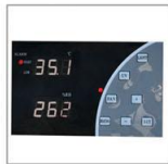
LED Display Temperature and humidity, with fan, UV lamp, fluorescent lamp, heating lamp control buttons.

E-mail: export@biobase.com www.biobase.cc / www.biobase.com