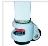
Footmaster Caster Universal caster with brake and leveling feet, easy to move and fix