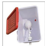
Depressurization Type Water Tank With automatic feed water system, labor saving